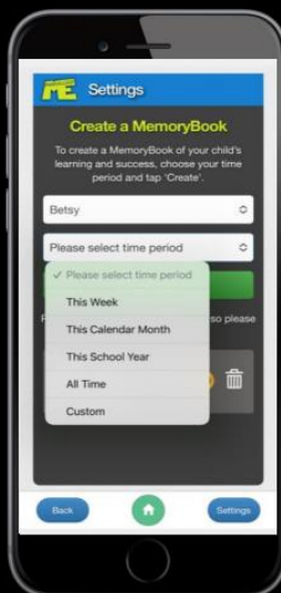
Select the child and the time period you want to report the MemoryBook for. Tap 'Create'.