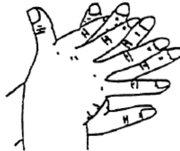
• Right palm over left dorsum and left palm over right dorsum