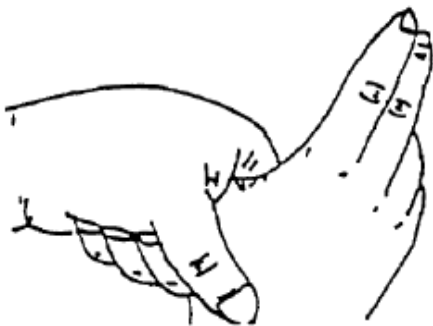
5. Rotational rubbing of right thumb clasped in left palm and vice versa