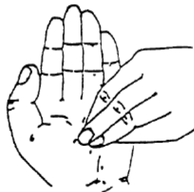
6. Rotational rubbing, backwards and forwards, with clasped fingers of right hand in left palm and vice versa