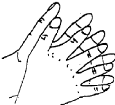
3. Palm to palm fingers interlaced